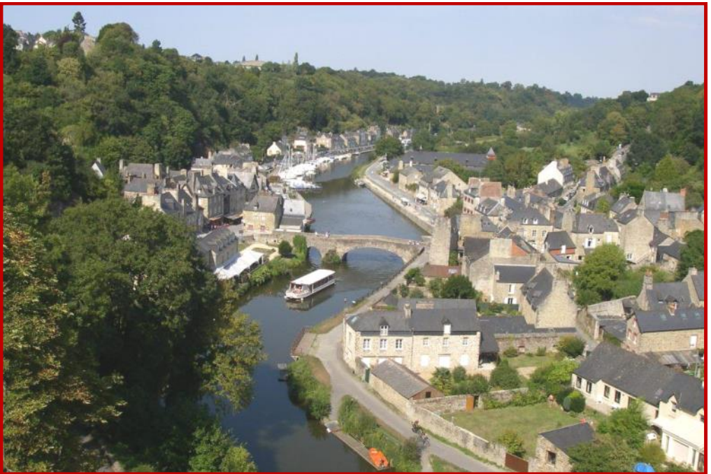
Dinan Port From Viaduct

We walked along the towpath the four miles from Dinan to the lock at Lyvet and in the marina spotted two narrowboats amongst the many cruisers and yachts. Until 1830 the River Rance was tidal as far as Dinan but a dyke was built at Lyvet in the early 19th century as part of the Ille et Rance Canal thereby leading to commercial carrying supplying wood, cider and agricultural produce. A bridge was built in 1896 but destroyed in August 1944. It was replaced in 1950 and a swing bridge by the lock was added in the 1970s.