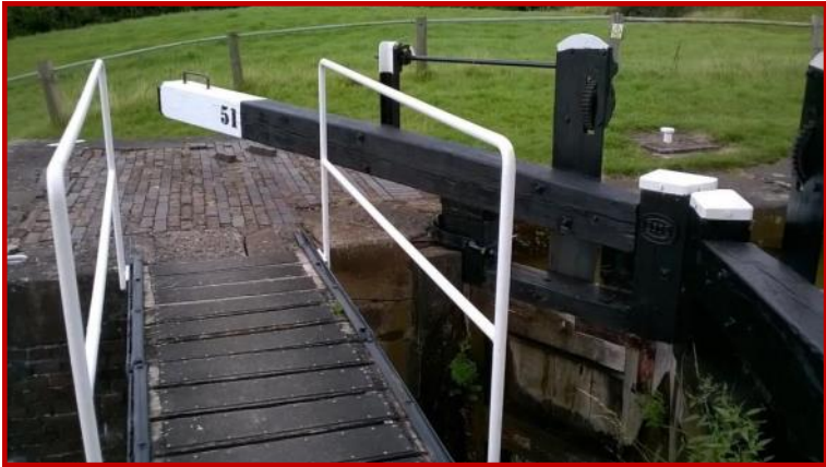
Lock 51 Finished