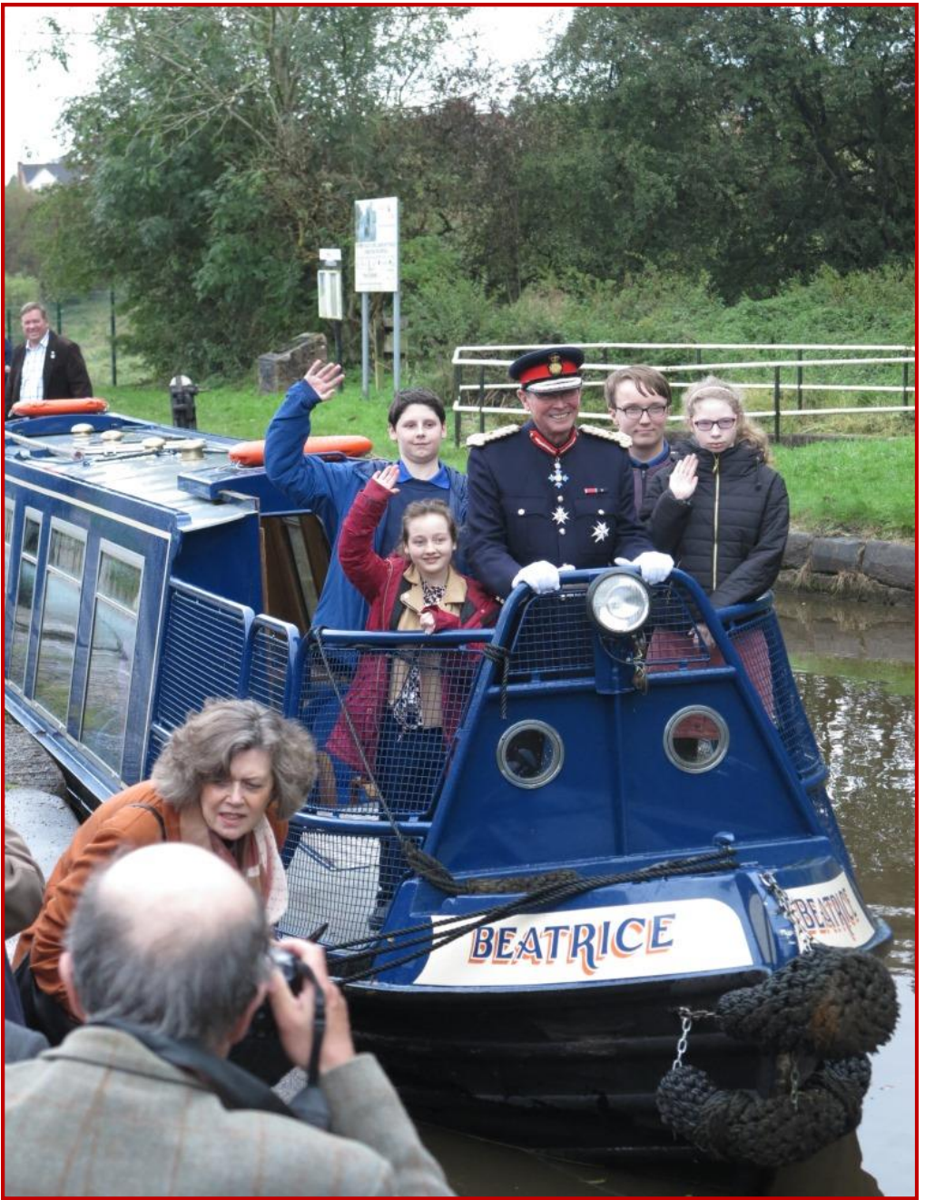
Disabled boat Beatrice (now based on the Caldon) wins the Queen's Award for Voluntary Service, pictured here with our patron.