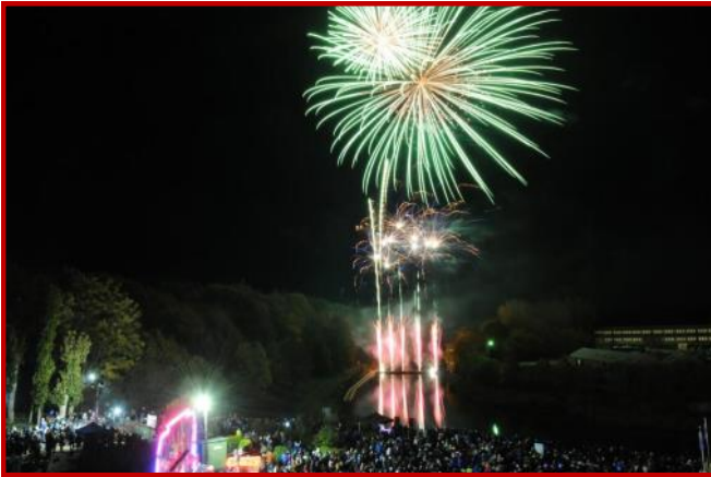
Anderton Boat Lift's spectacular firework display in action last year

One of the most iconic sights on British waterways, the Anderton Boat Lift, often referred to as the 'Cathedral of the Canals' connects the Trent & Mersey Canal to the River Weaver near Northwich, Cheshire