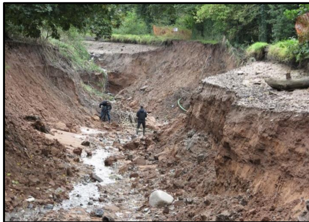
TV Crew in Dutton Breach ( Roger Evans )

but the parallel "Telford" tunnel was restored and reopened in 1977 after our 3-year campaign.