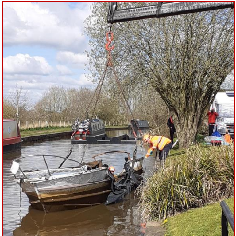
Lifting cradle positioned and attached to the crane