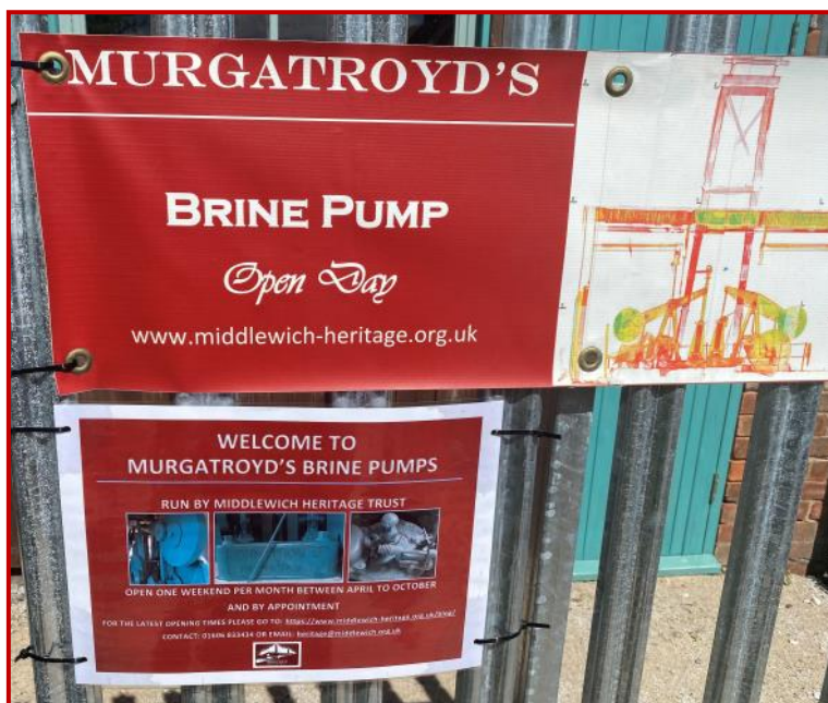
Open day poster on gate