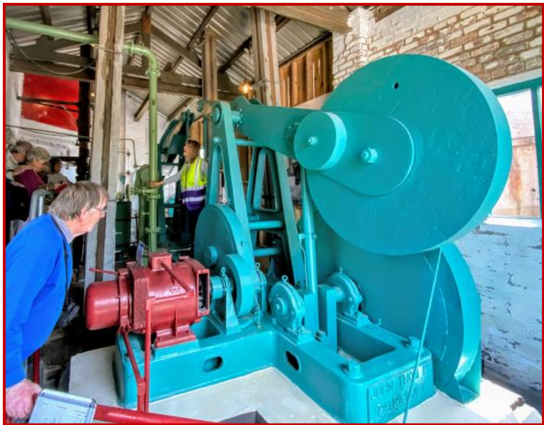
The famous pump itself