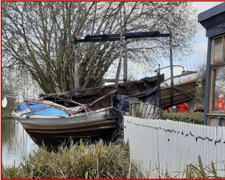
Tense moment as the lifting straps start to cut into the composite hull