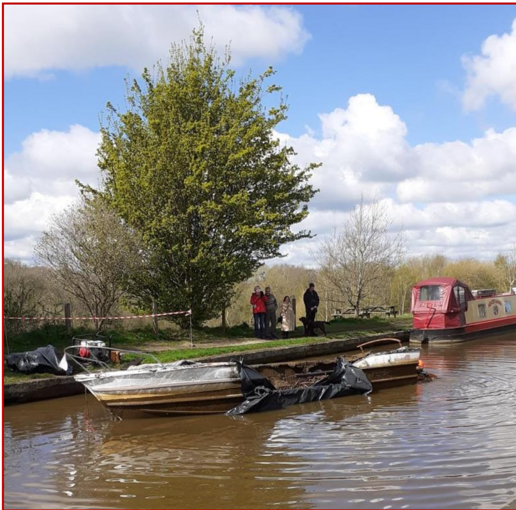
Damaged cruiser on the Cheshire Flight (see p.6/7)