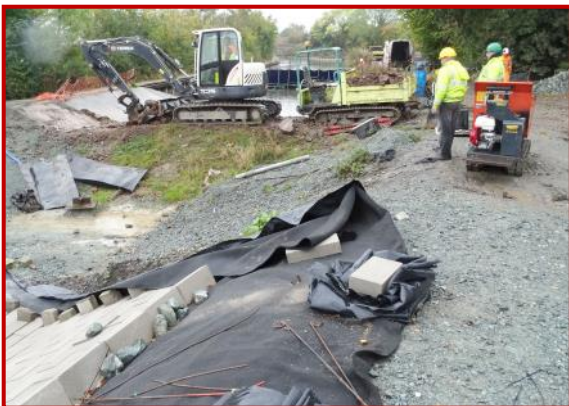
Clay dam removal