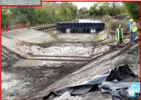
The final set of blocking.