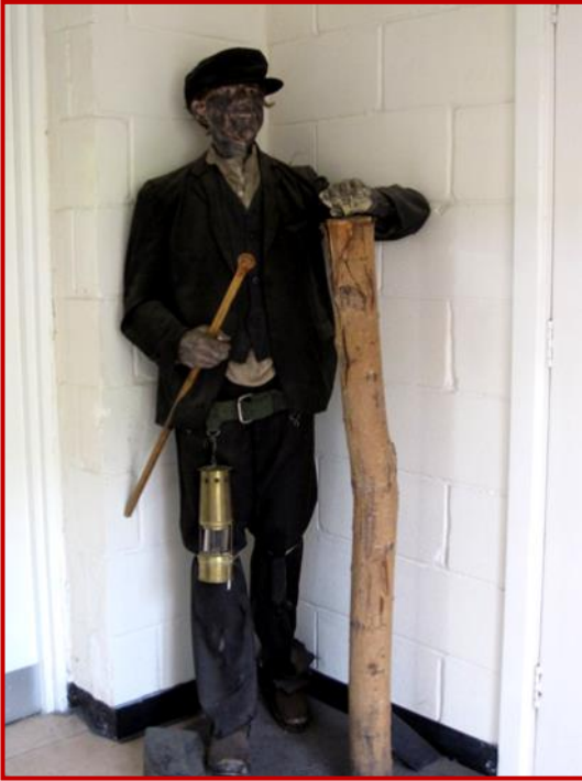
Miner with pit prop Standing guard Outside museum door!