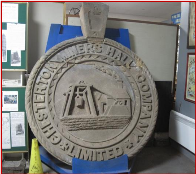
Miners' medallion in stone